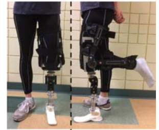
Figure 1. Fabricated TPG simulator

flexion was used to immobilize the subject's lower leg and to securely attach the simulator to the subject's leg. The user wore a knee pad with Velcro to secure the knee in place with the connector (Fig.1).